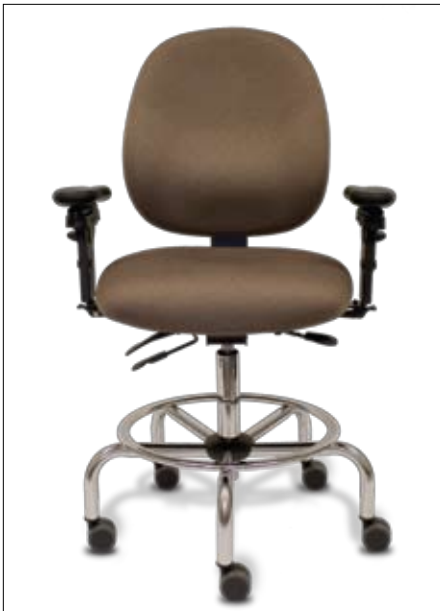
CLS57 (shown w/KR251 arms) Extra generous seat and back design inspired by the PA57