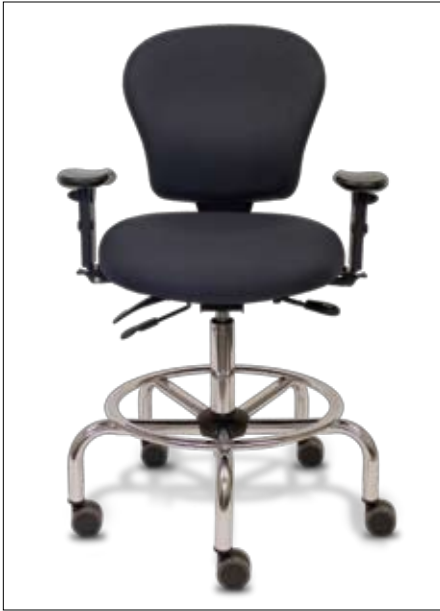
CLS53 (shown w/KR240M arms) Great for petite to medium builds and based on the design of the PA53