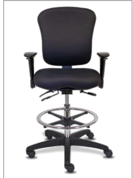
CLS61 (shown w/JR37 arms and optional Turn-lock footring package) Adjustable footring available for upcharge.