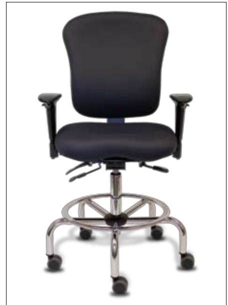
CLS61 (shown w/JR37 arms) Attractive and versatile stool with the amazing contours and "sit" of the PA55